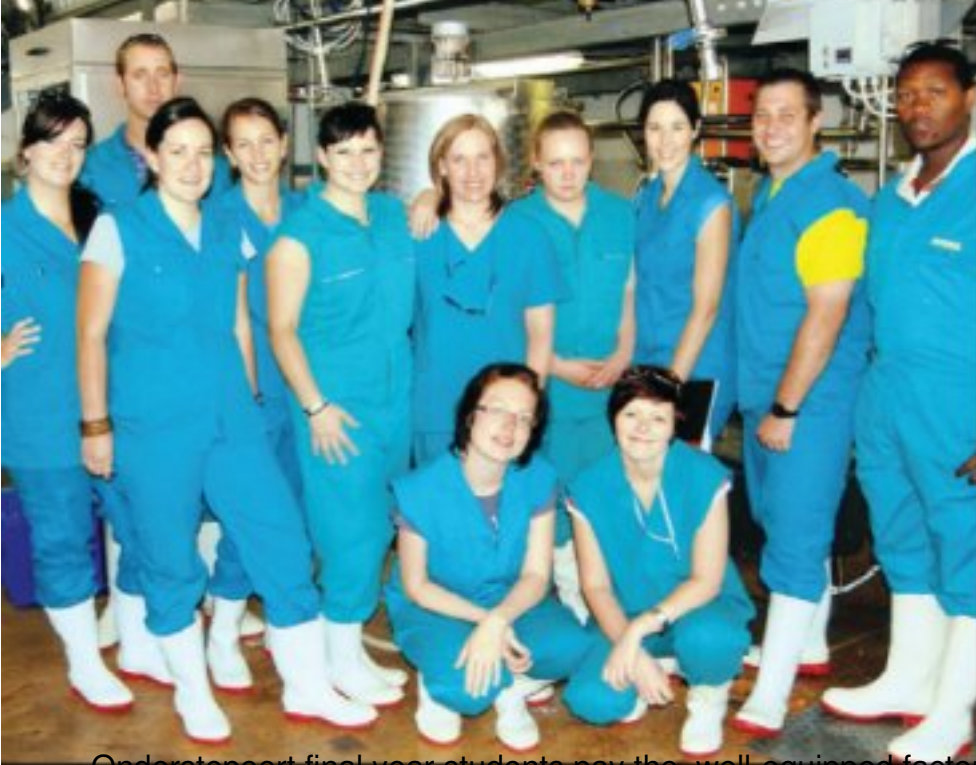
Onderstepoort final year students pay the well-equipped factory on the farm a visit