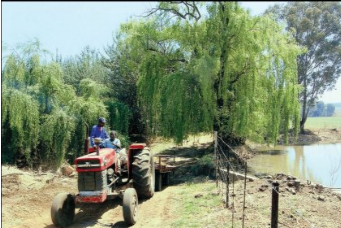
The Willows on Willow Valley Farms really do credit to the name