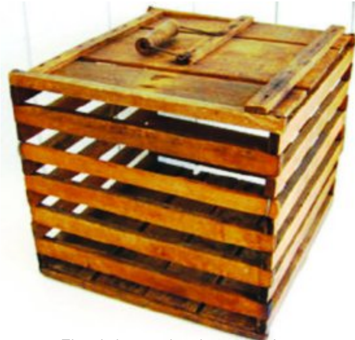
Eiers is in so 'n houtkrat verpak