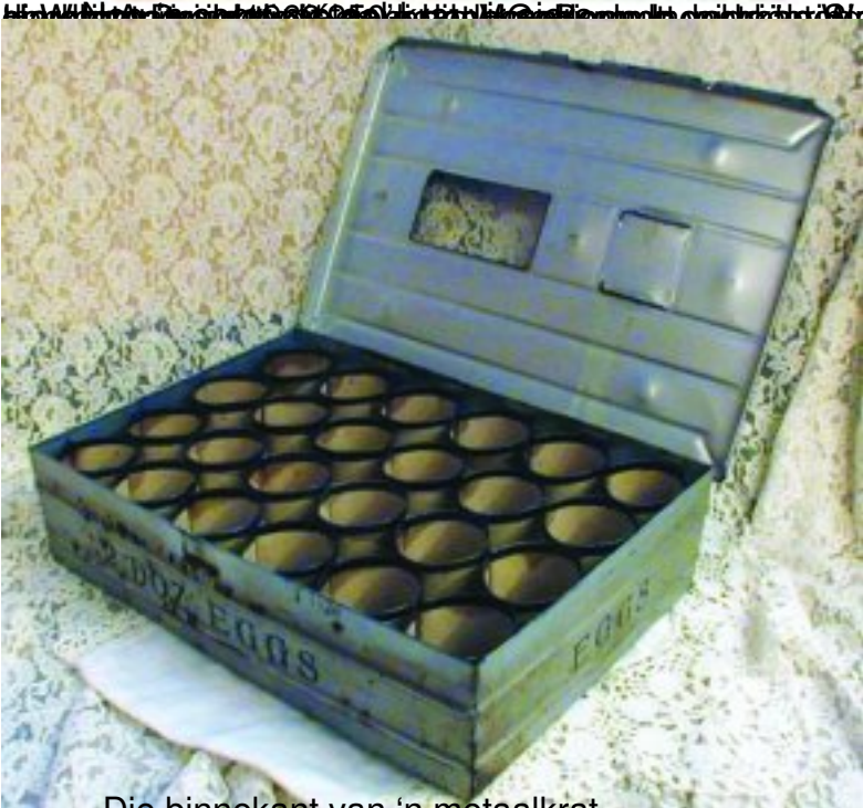
Die binnekant van 'n metaalkrat