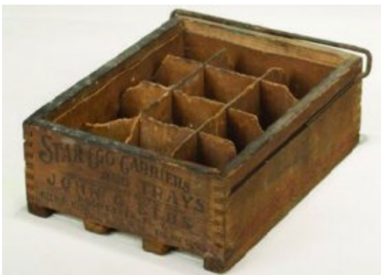
Reghoekige kompartemente vir eiers